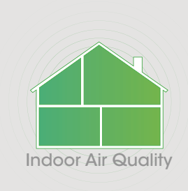
Indoor Air Quality